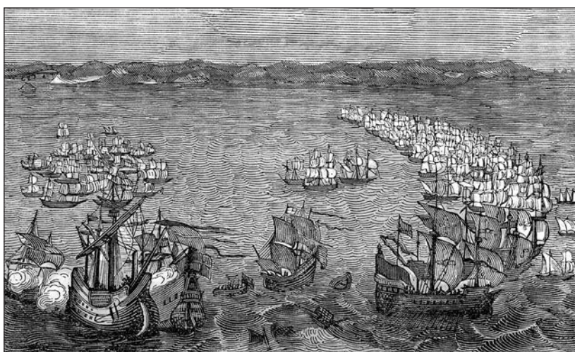
[Naval warfare in the 16th century]